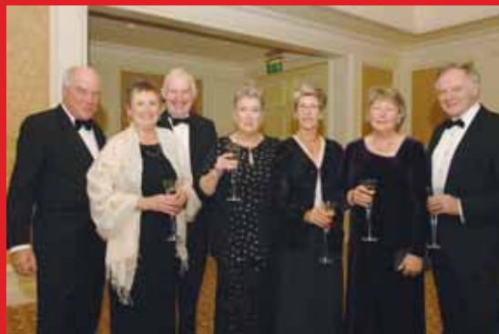
The Irish Heart Foundation Ball.