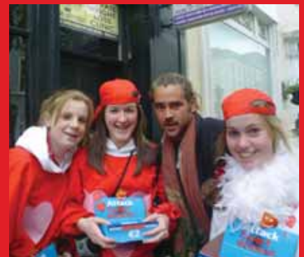
"We sold a happy heart to Colin Farrell".