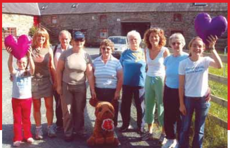
Hacketstown World Heart Day Walkers