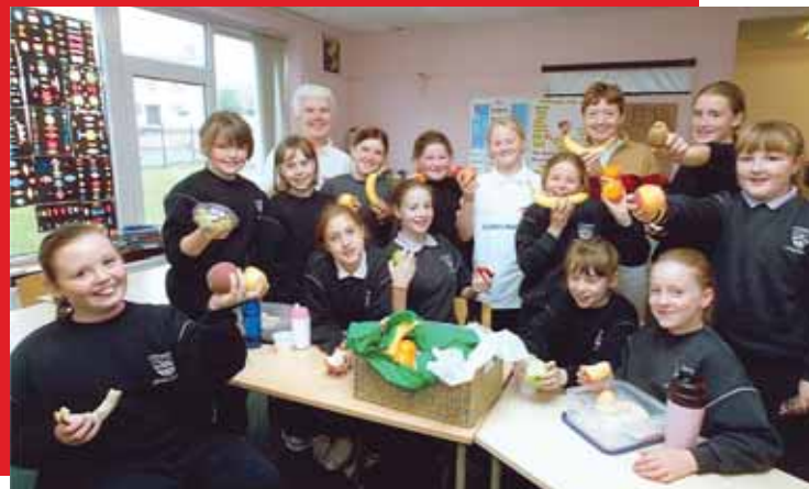
Pupils from St. Brendan's Primary School, Cork taking part in their healthy lunchbox campaign during Irish Heart Week.