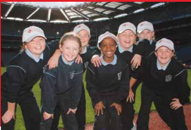
Pupils from North Presentation Primary School in Cork city doing the Bizzy Break at Croke Park at the launch of Irish Heart Week.

Happy Heart Offices are based in Carlow, Cork and Waterford. Through this network, the IHF works with the community to raise awareness of heart health. Activities include the dissemination of information and organisation of events at local level in support of campaigns such as Happy Heart Eat Out and Irish Heart Week.