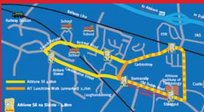
Athlone, Slí na Sláinte

To ensure the continued success of the Slí na Sláinte programme it is essential that quality and safety on all the routes throughout the country is sustained. In 2005 we continued to work closely with several local authorities and communities, carrying out route audits followed by maintenance where needed.