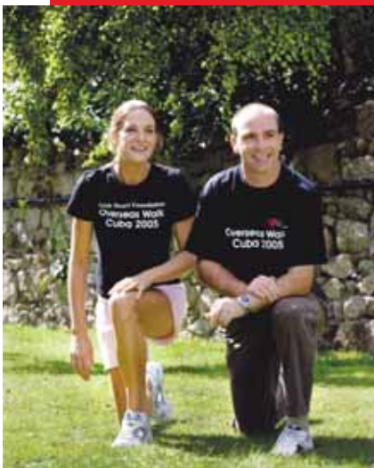
Hurling legend DJ Carey at the launch of the 2005 Overseas Walk to Cuba.

Hurling legend DJ Carey joined 40 walkers on the annual Overseas Walk in Cuba. The walk, delayed by hurricanes to November 2005, was one of the most challenging and interesting of all walks. While these walks play an important role on the fundraising calendar, they also provide an important opportunity to broaden the network of volunteers for other fundraising activities. In 2005 the walk raised €188,467. With DJ's continued support, 60 registered walkers are fundraising for the walk in Tanzania 2006.