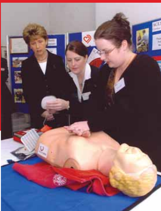
The launch of Heartsafe with the President of Ireland, Mary McAleese.

The Irish Heart Foundation awards 'Heartbeats' in recognition of each step a community takes to strengthen its Chain of Survival. Heartbeats can be earned for such things as CPR training, having an AED Programme or written plans for CPR/AED/Emergencies in your community. The programme recognises four different types of communities and each has different heartbeat criteria and requisites to become Heartsafe. The four different types of communities which can apply to the programme are: Communities (towns and villages), Schools, Workplaces and Healthcare Facilities.