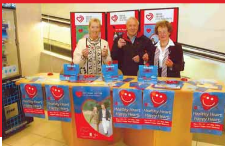
Happy Heart Weekend Volunteers collecting in Cork.

The Irish Heart Foundation introduced a special 'Wear Red Day' as part of Happy Heart Weekend 2005. 20,000 companies and retail outlets were canvassed to ask their staff to wear red clothes on Friday, May 13th and to donate €2 to the Irish Heart Foundation. Almost 2,000 companies responded and with matched donations, €69,000 was raised. Wear Red Day 2005 was supported by Thomes Crosbie Holdings, Boots & Dunnes Stores. Wear Red Day 2006 will take place as a stand alone project.