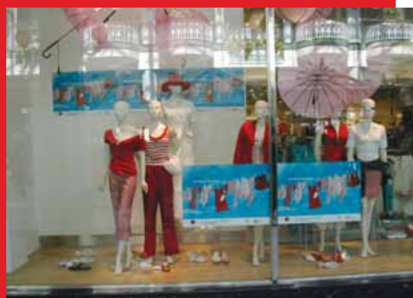
Dunnes Stores shopfront, supporting Wear Red Day.