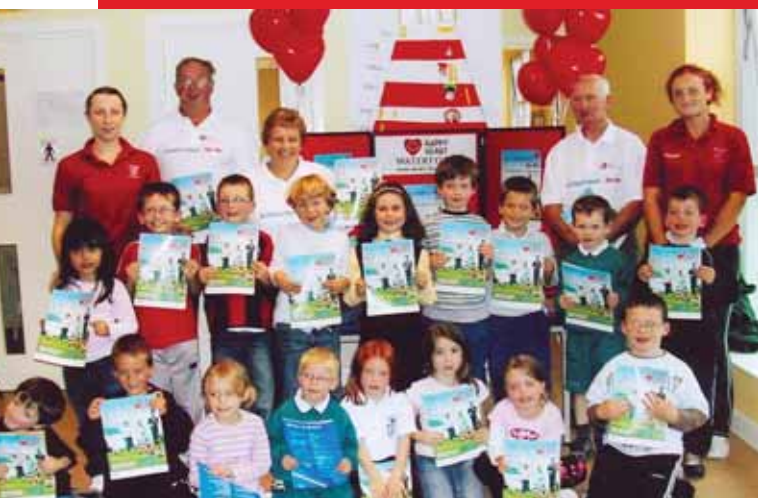
Children from the Jigsaw After School Club, Waterford after successfully completing the 6 week "Let's Get Physical" activity programme in 2005.

The Irish Heart Foundation worked on a project of promoting health through the arts in association with Blue drum and the South Wexford Community Group. Work has been progressing to develop this as a model for other community groups.