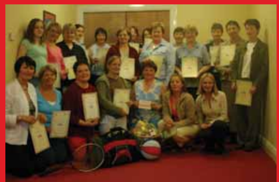
Employees from the HSE South, Skibbereen office receiving their certificates for completing the Lifestyle Challenge.