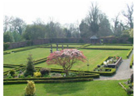
The grounds of St Dominics Retreat Centre

For more relaxation tips see www.irishheart.ie and search under stress.