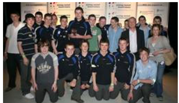
Good Counsel College New Ross Co Wexford. Winners of Physical Health Section with their project "Don't Skip a Beat"