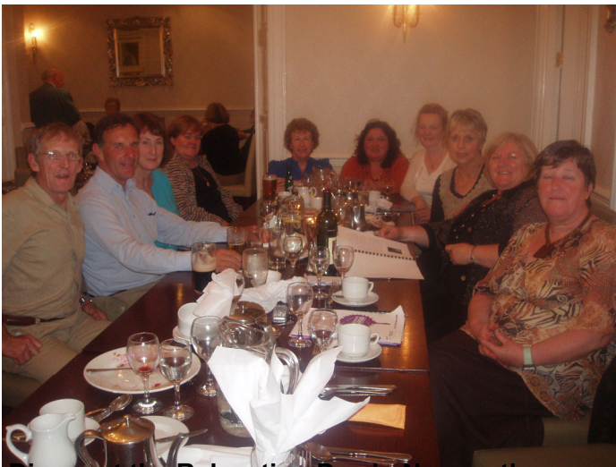
Dinner at the Relaxation Day in Newcastle, Wicklow, May 2008